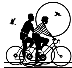
Twin Lights Ride—September 29